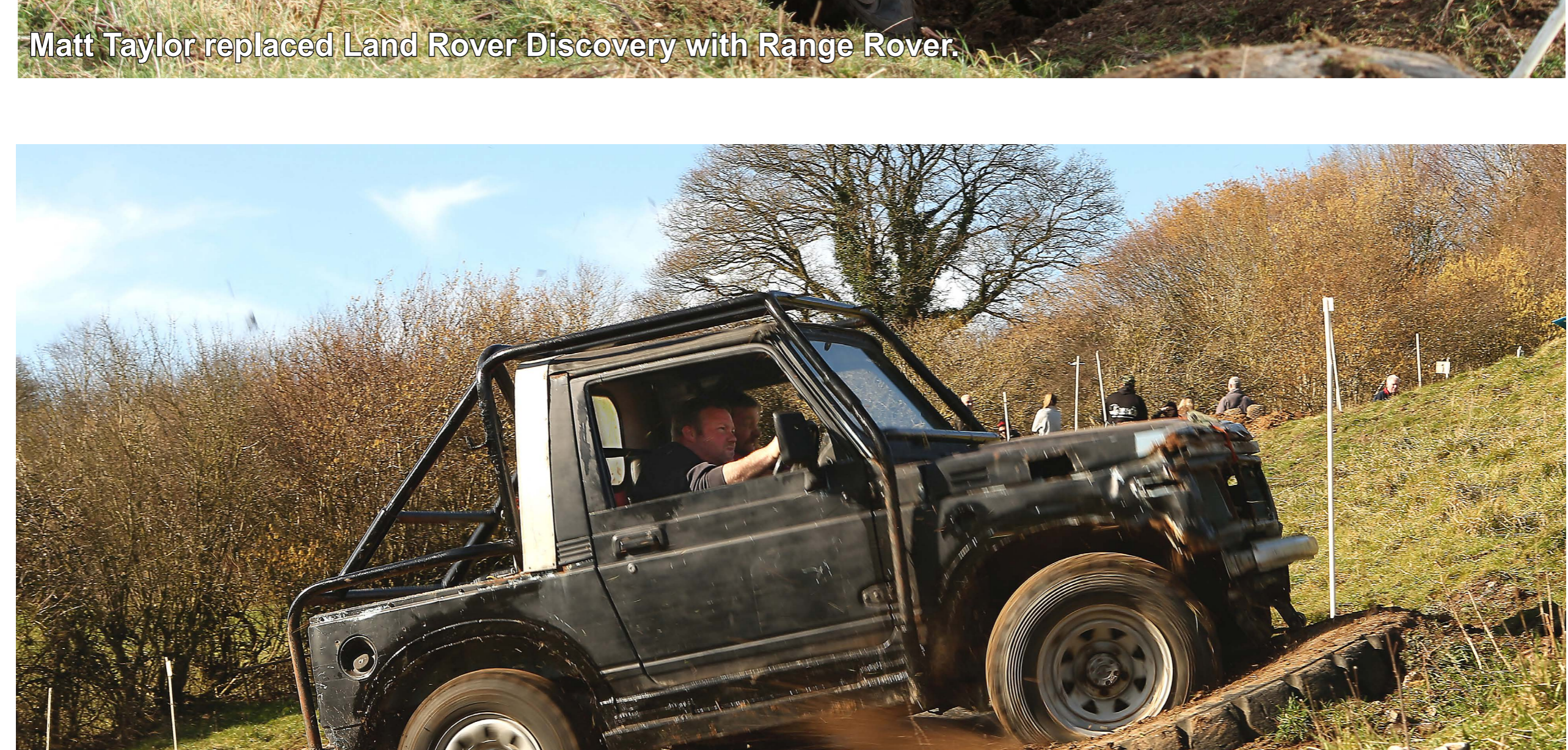
Exuberant drive from Derek Callaway but failed to make the finish