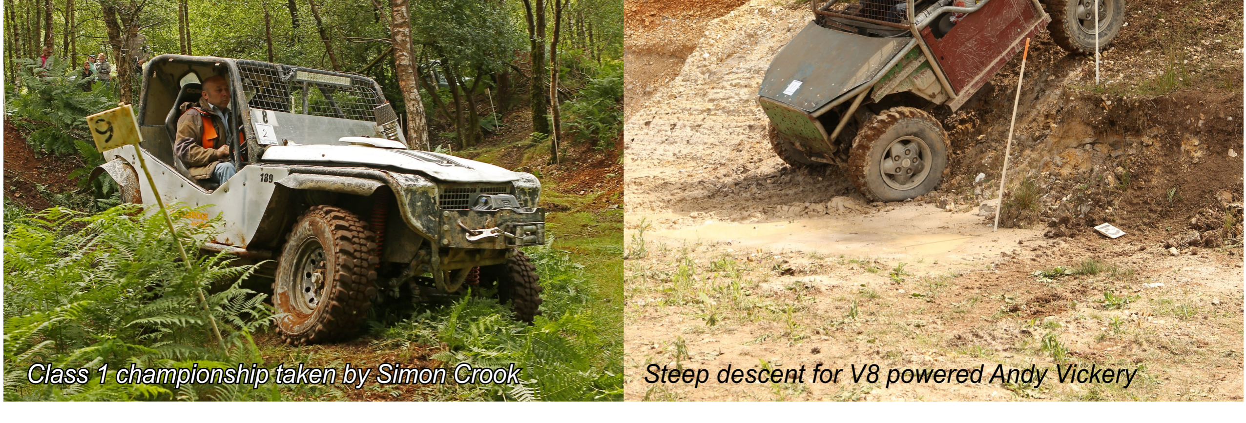
Class 1 championship taken by Simon Crook