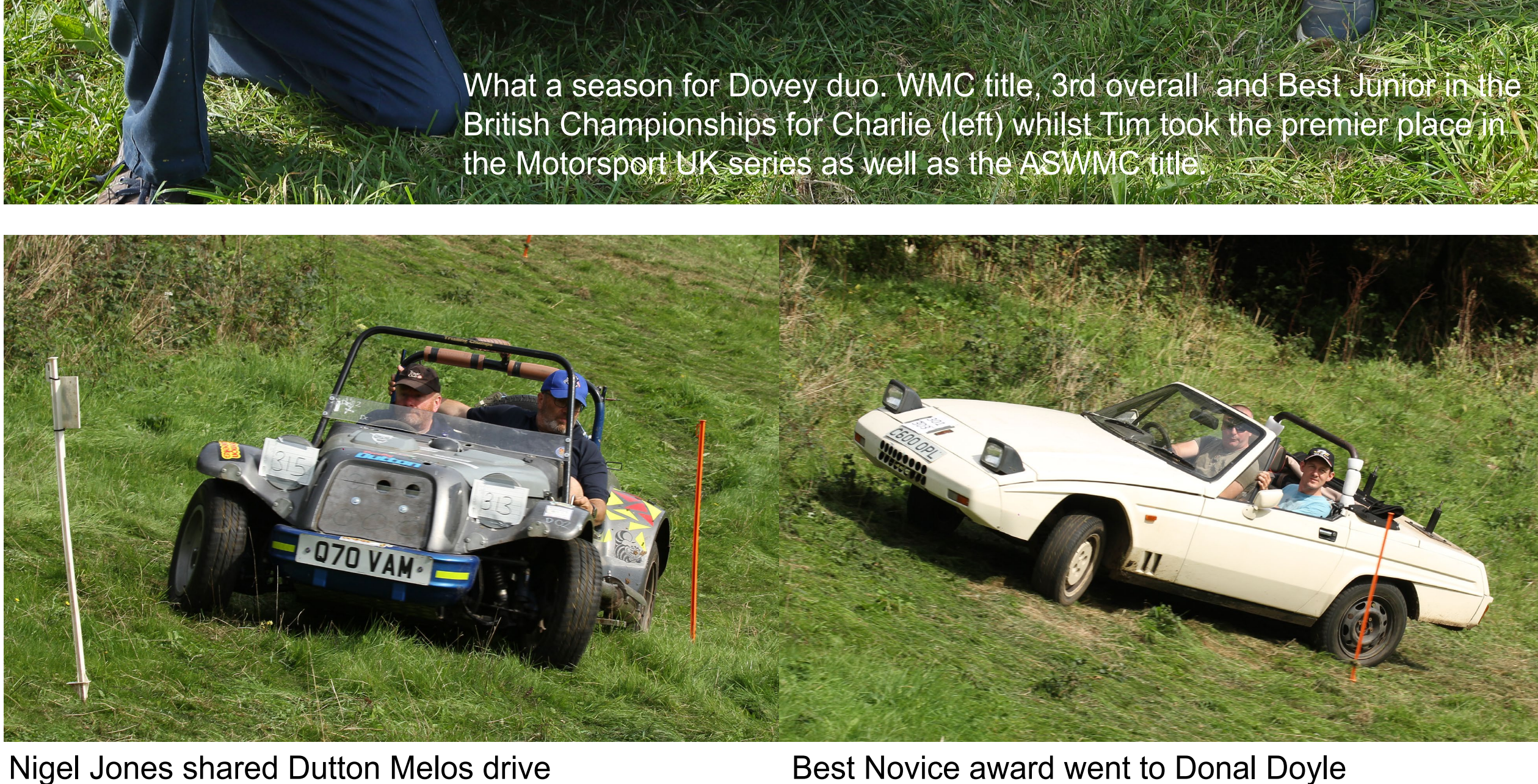
Next Car Trial