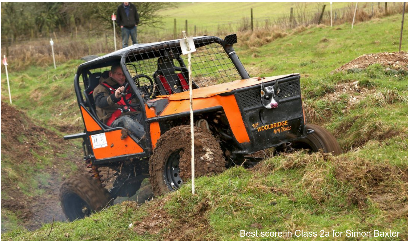
Best score in Class 2a for Simon Baxter