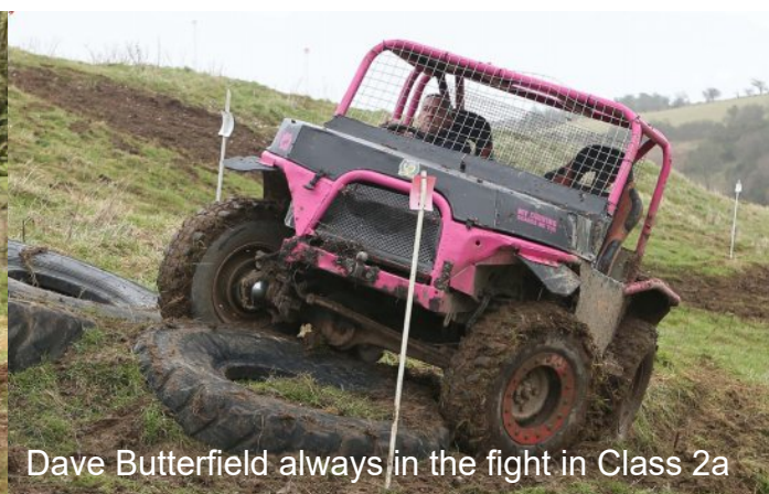
Dave Butterfield always in the fight in Class 2a