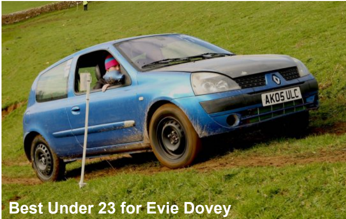
Best Under 23 for Evie Dovey