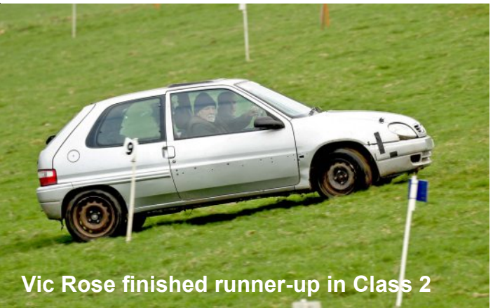
Vic Rose finished runner-up in Class 2