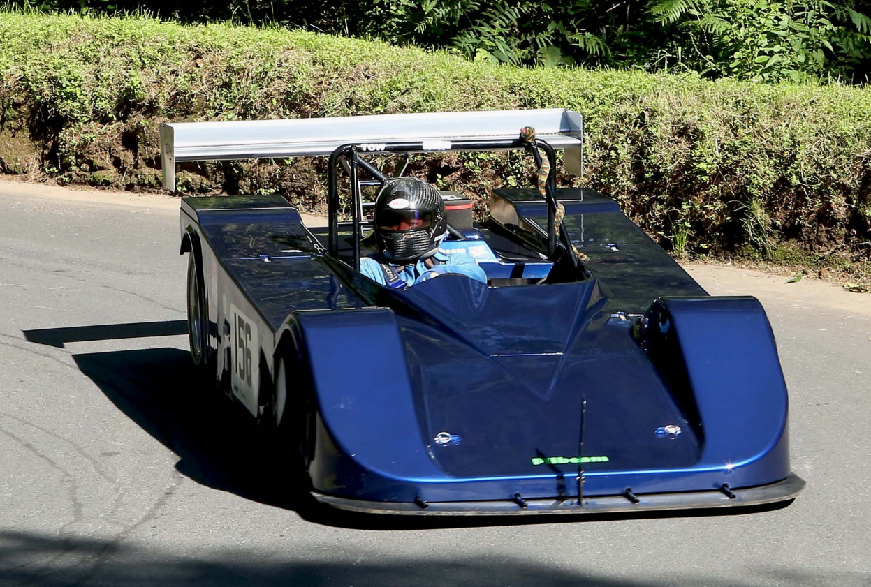
Rod Thorne transitions from bright sun to shade