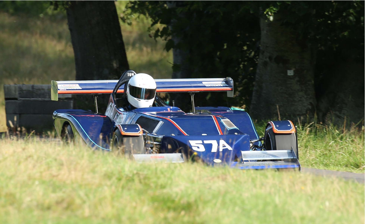
A rare sight at Wiscombe these days - a Mallock