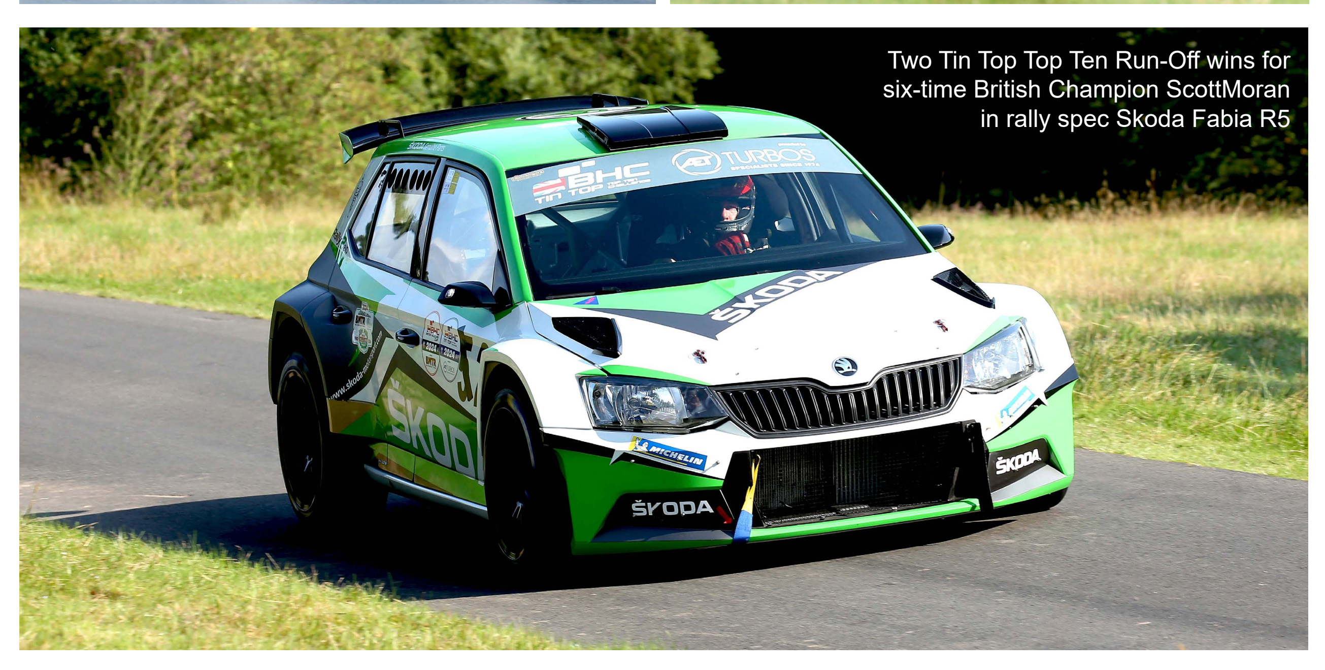
Full results of the Woolbridge National and Interclub events plus Run-Offs are available at www.swtimekeeping.co.uk/times-from-2024