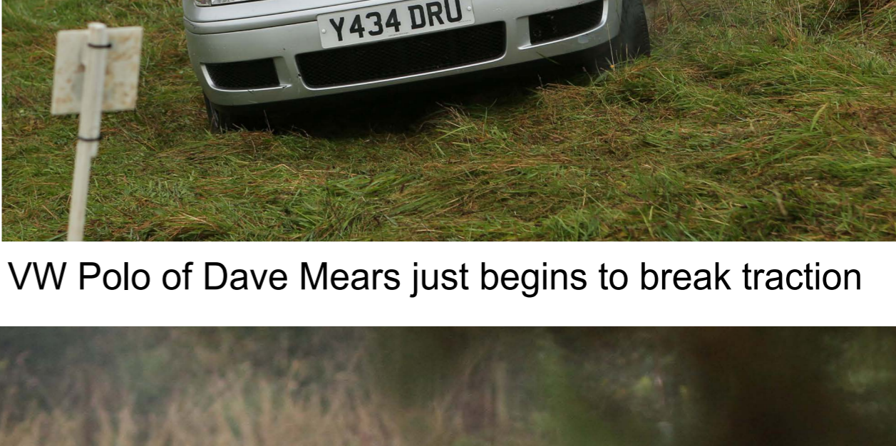
VW Polo of Dave Mears just begins to break traction