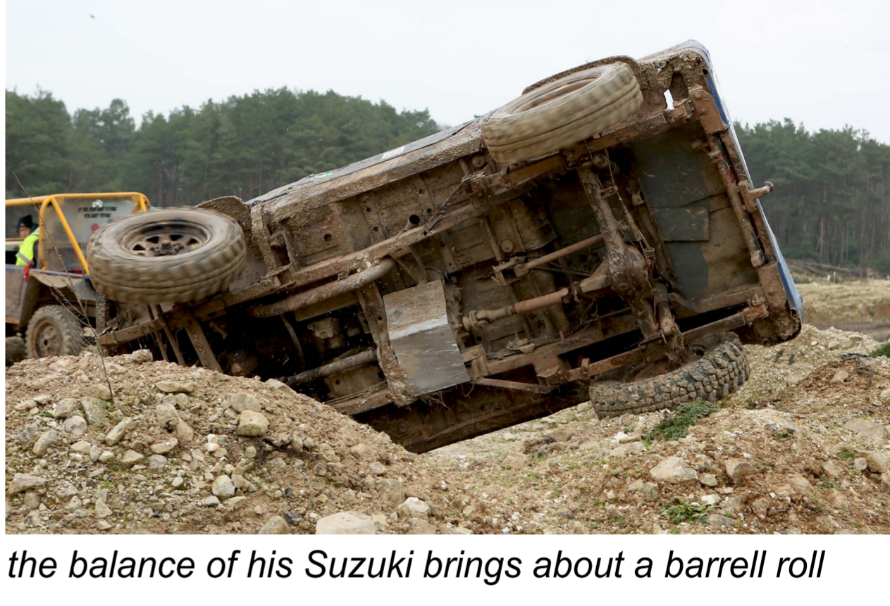
Shannon Butterfield gives suspension a work out