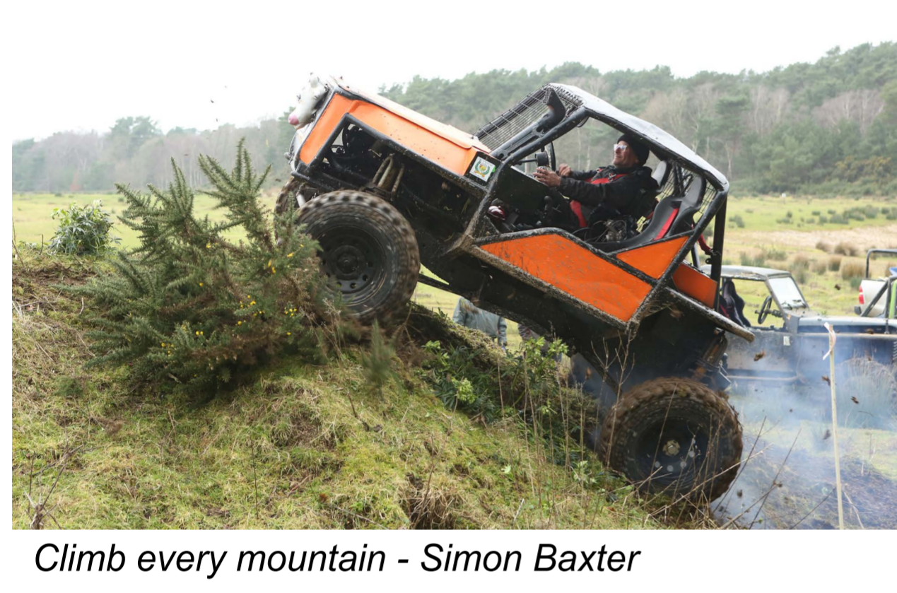
Climb every mountain - Simon Baxter