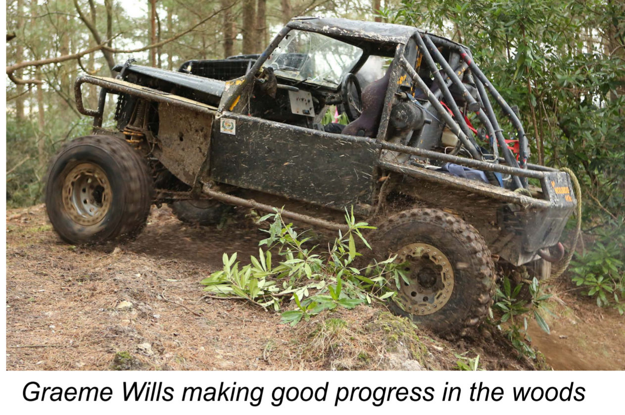
Graeme Wills making good progress in the woods