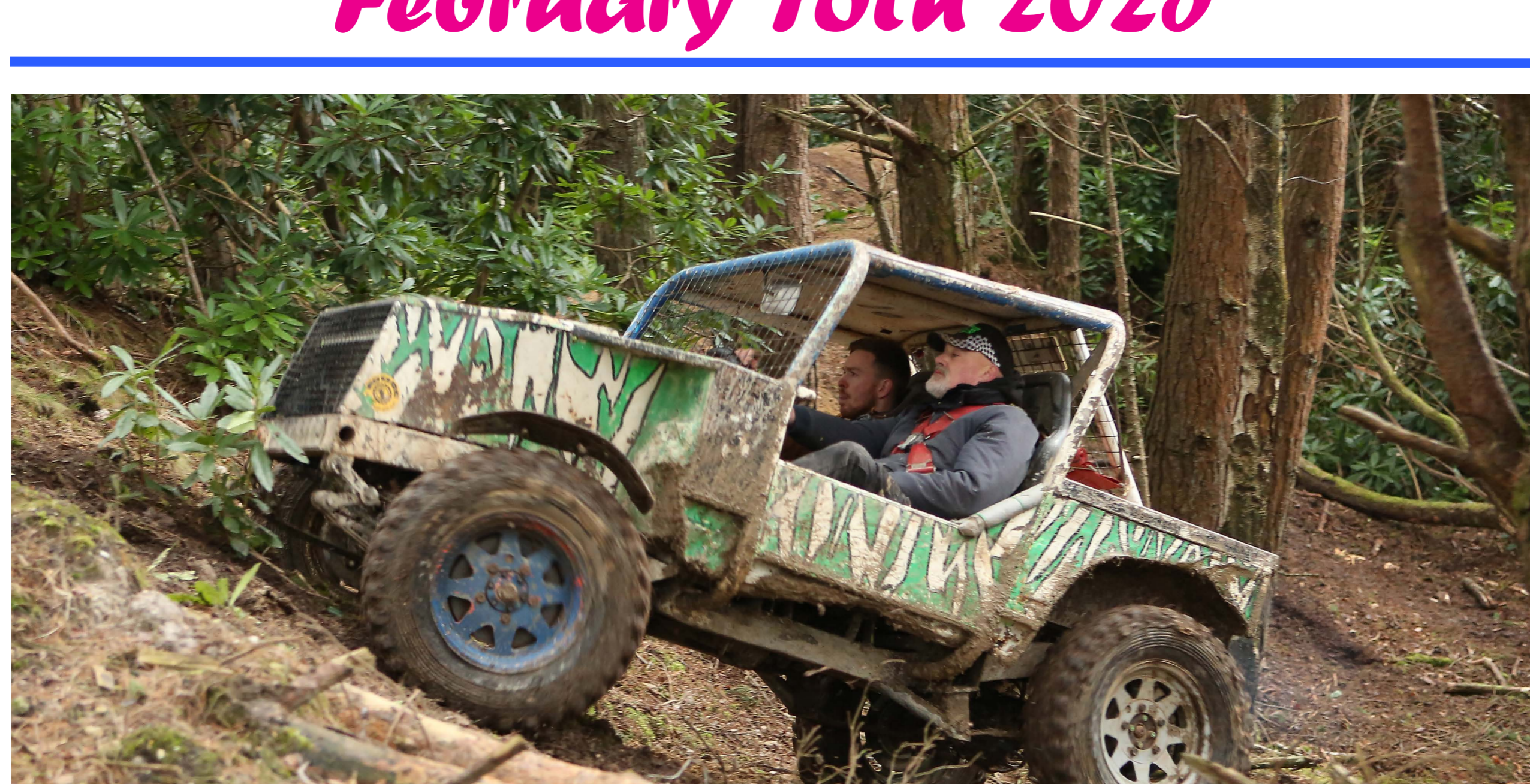
Camouflage in the woods