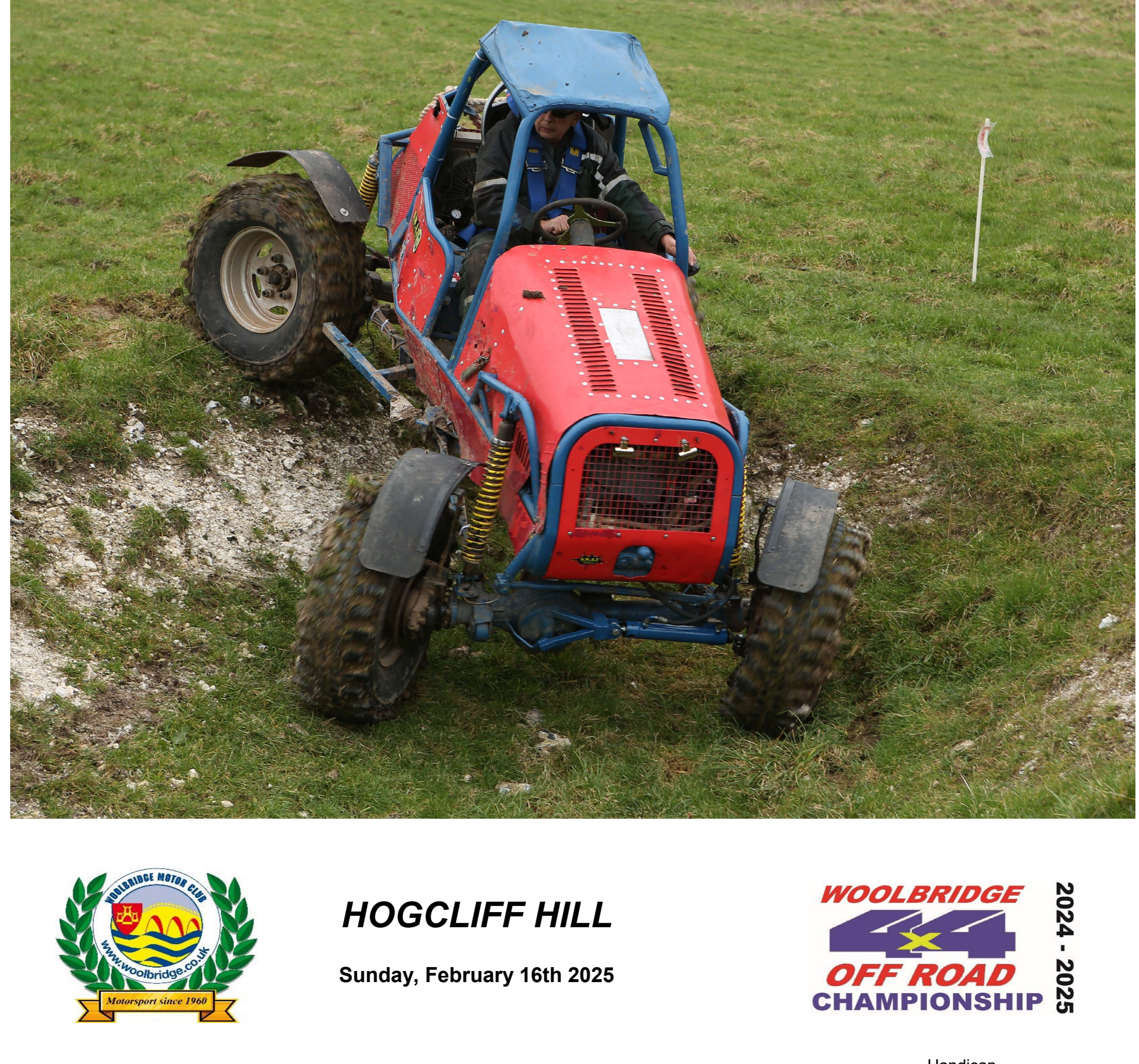
Geoff Rushe with his unusual four wheel steer machine