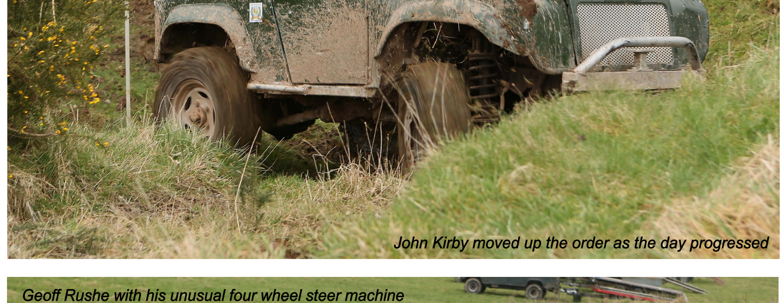
John Kirby moved up the order as the day progressed